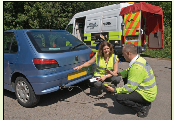
Emission Testing at Lakeside Country Park

Proposed actions to improve air quality are listed below. Most of the actions relate to reducing vehicle use, improving traffic flows and increasing use and reliability of public transport.